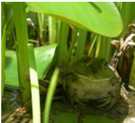
Frog in the shade.

When I reflect on the incredible effort that SWLA's members and volunteers have made over the years to save this community's river, forests, bogs, and brooks, I realize how right Aldo Leopold was when he said that people only protect what they care for, and they only care for what they come to know. Without SWLA we would not be able to know Whitten Hill, the Hogback, Bog Brook, or many portions of the Upper Sheepscot River. Even if we only rarely find time to break free from the frantic pace of modern life to take that quiet meander, to wait for the beaver to find his courage, or to allow the secret whisperings of the forest to fill our imaginations, these places are there for us to know thanks to a vibrant group of people, who care deeply for the land, and understand that left to her own devices, nature offers us the best examples of how to weave peace, inspiration, and beauty into our individual lives, and the larger world.